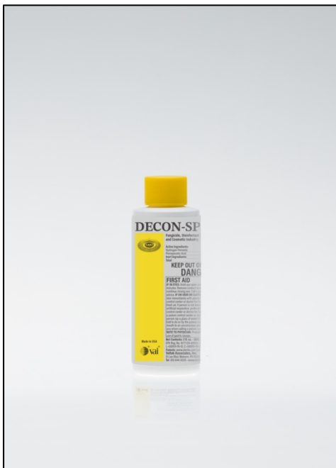
DECON-SPORE 200 Plus 2 oz Concentrate, Unit Dose, Sterile DS200-03-2ZA-C