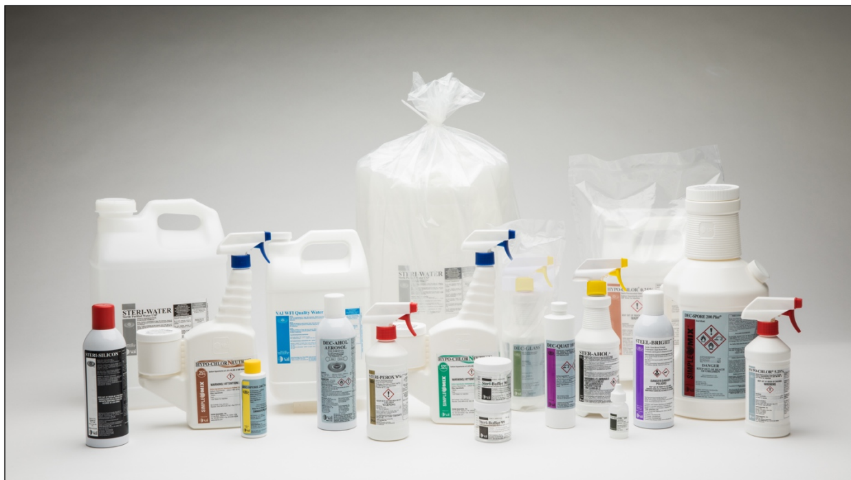
VAI®'s SCMD Product Family

VAI's Sterile Chemical Manufacturing Division (SCMD) manufactures a complete range of cleaning agents and disinfectants that are used daily in cleanroom operations. Overall, VAI's capabilities for manufacturing products include the ability to fill aerosol, bulk, and unit dose packages in ISO 5 or 7 (Grade A/B). Our aseptic filling operations are coupled with the validated and proven ability to irradiate a final product. Assurances are taken in every aspect of SCMD concerning sterility and particulate removal. VAI's operations mirror current GMP's and enforces the adherence to USP specifications. VAI is an EPA and FDA registered facility.