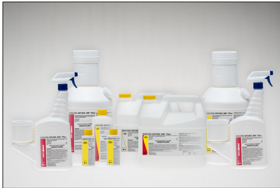
DECON-SPORE 200 Plus Product Family