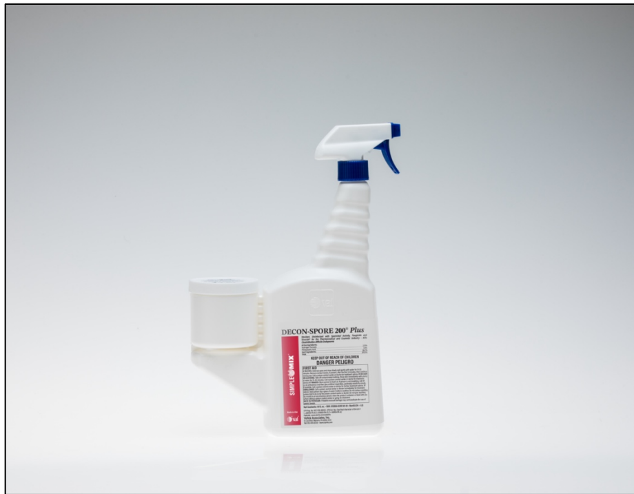
DECON-SPORE 200 Plus 16 oz SimpleMix Trigger, Sporicidal Dose, Sterile DS200-06-16Z-01-C