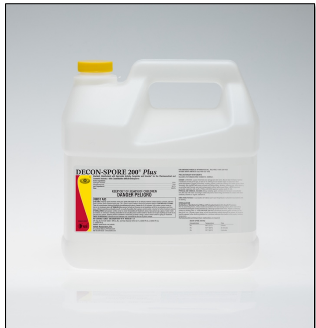
DECON-SPORE 200 Plus 1 Gallon Concentrate, Sterile DS200-02A-C