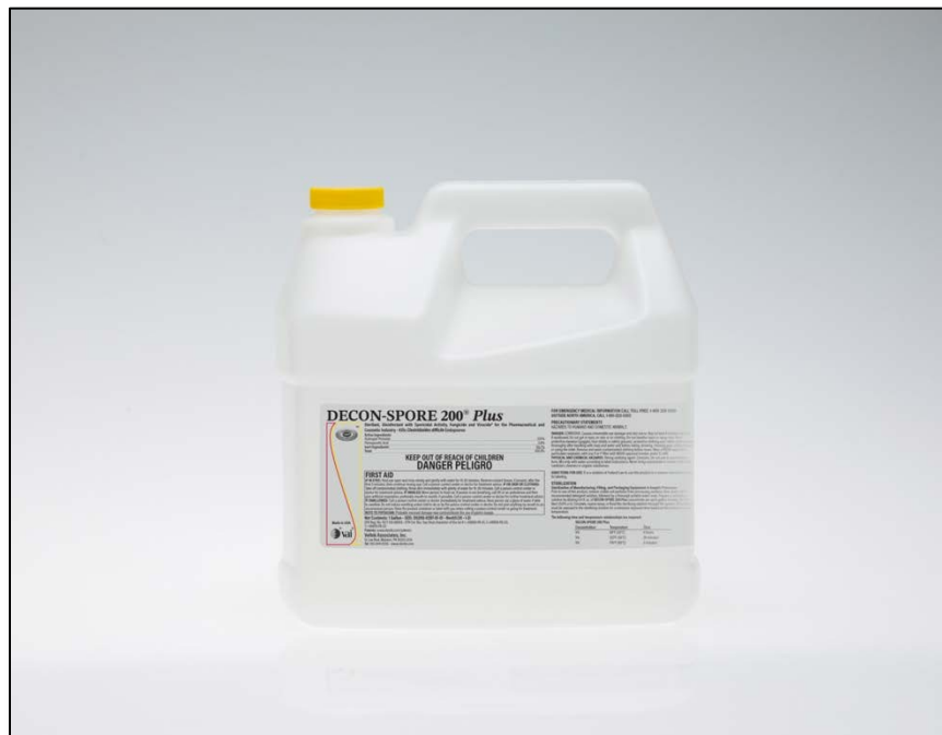
DECON-SPORE 200 Plus 1 Gallon Concentrate, Non-Sterile DS200-01A-C