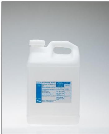
2 Gallon Water VAI-WFI-2G