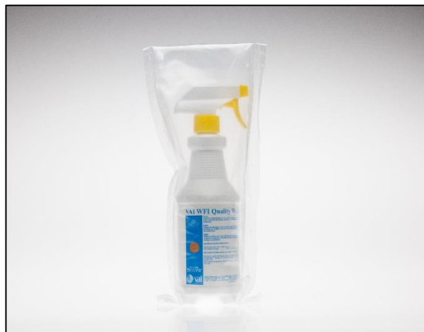
16 oz Attached Trigger Spray VAI-WFI-16Z

Any specific product label is available upon request.