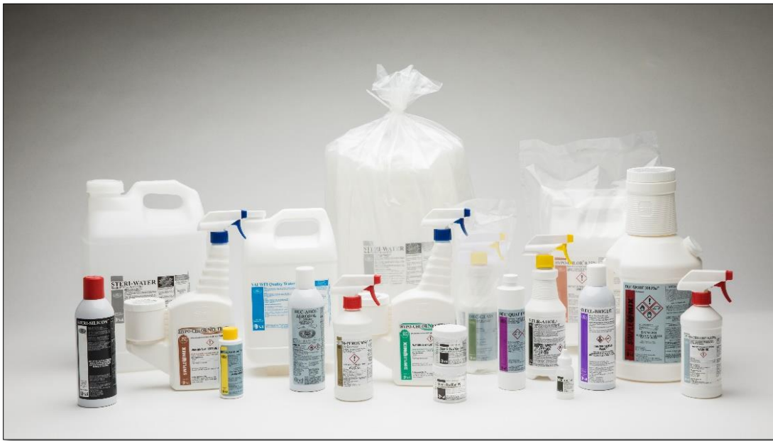
VAI's SCMD Family of Products

VAI's Sterile Chemical Manufacturing Division (SCMD) manufactures a complete range of cleaning agents and disinfectants that are used daily in cleanroom operations. Overall, VAI's capabilities for manufacturing products include the ability to fill aerosol, bulk, and unit dose packages in ISO 5 or 7 (Grade A/B). Our aseptic filling operations are coupled with the validated and proven ability to irradiate a final product. Assurances are taken in every aspect of SCMD concerning sterility and particulate removal. VAI's operations mirror current GMP's and enforces the adherence to USP specifications. VAI is an EPA and FDA registered facility.