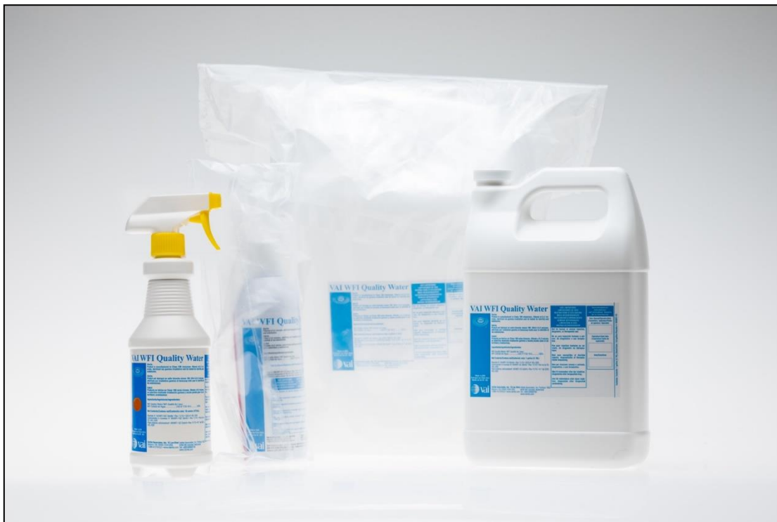
VAI WFI Quality Water Family of Products